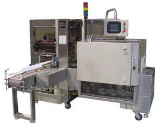
Pharmaceutical Series Shrink Bundler