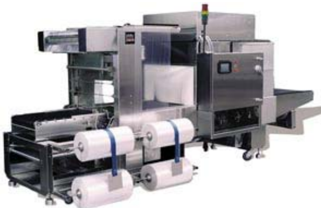
IL Series Shrink Bundler

Every PolyPack machine is designed to be fully modular in design. By piecing together the right combination of components, we are able to create a machine tailored to a particular application. The flexibility gained by using our modular design allows us to further meet the future needs of growth and change. PolyPack's vast experience has allowed us to learn the needs of an industry and enabled us to incorporate new features required by many customers. Every machine PolyPack builds is easy to maintain and quick to changeover.